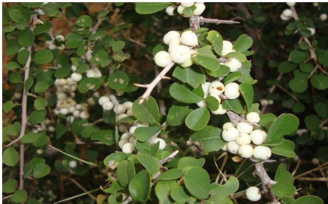
Figure 1. Habit and fruits of Flueggea leucopyrus Willd.

The dried fruit materials were pulverized into fine powder using a grinder (mixer). About 40gm of powdered fruit was extracted successively with 200 ml of hexane (62-66°C), chloroform (60-62°C) and methanol (56-60°C) in Soxhlet extractor until the extract was clear. The solvent extracts were evaporated by using rotary vacuum evaporator (Model: PBV – 7D) and the resulting pasty form extracts were stored in refrigerator at 4°C for further use [16].